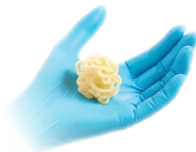
Puros DBM with RPM Gel