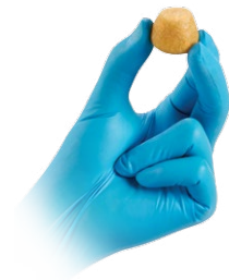
Puros DBM with RPM Putty