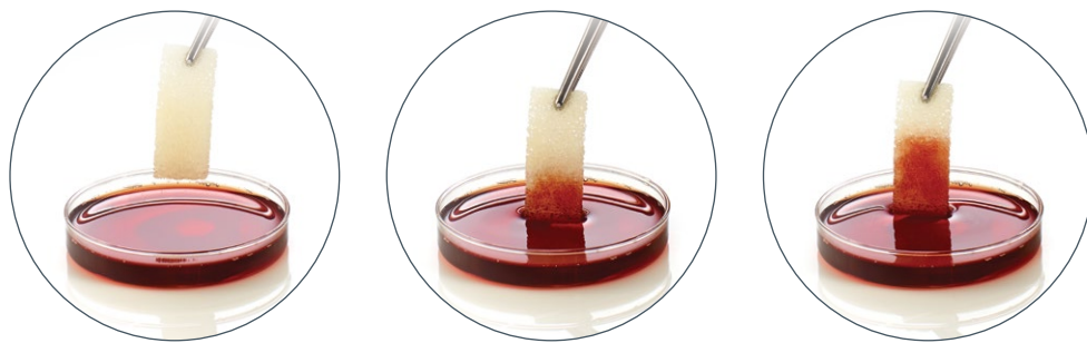
Blood-wicking capabilities (after minimal preparation)