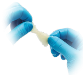
Puros DBM Strip