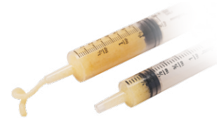
Puros DBM with RPM Paste