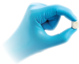
Puros DBM Block

With a variety of options, the Puros family of products can stimulate natural bone formation and assist in the healing process. Used alone or as a bone graft extender, Puros DBM allografts provide osteoconductive and osteoinductive properties, convenient handling and graft containment, and are provided ready to use.